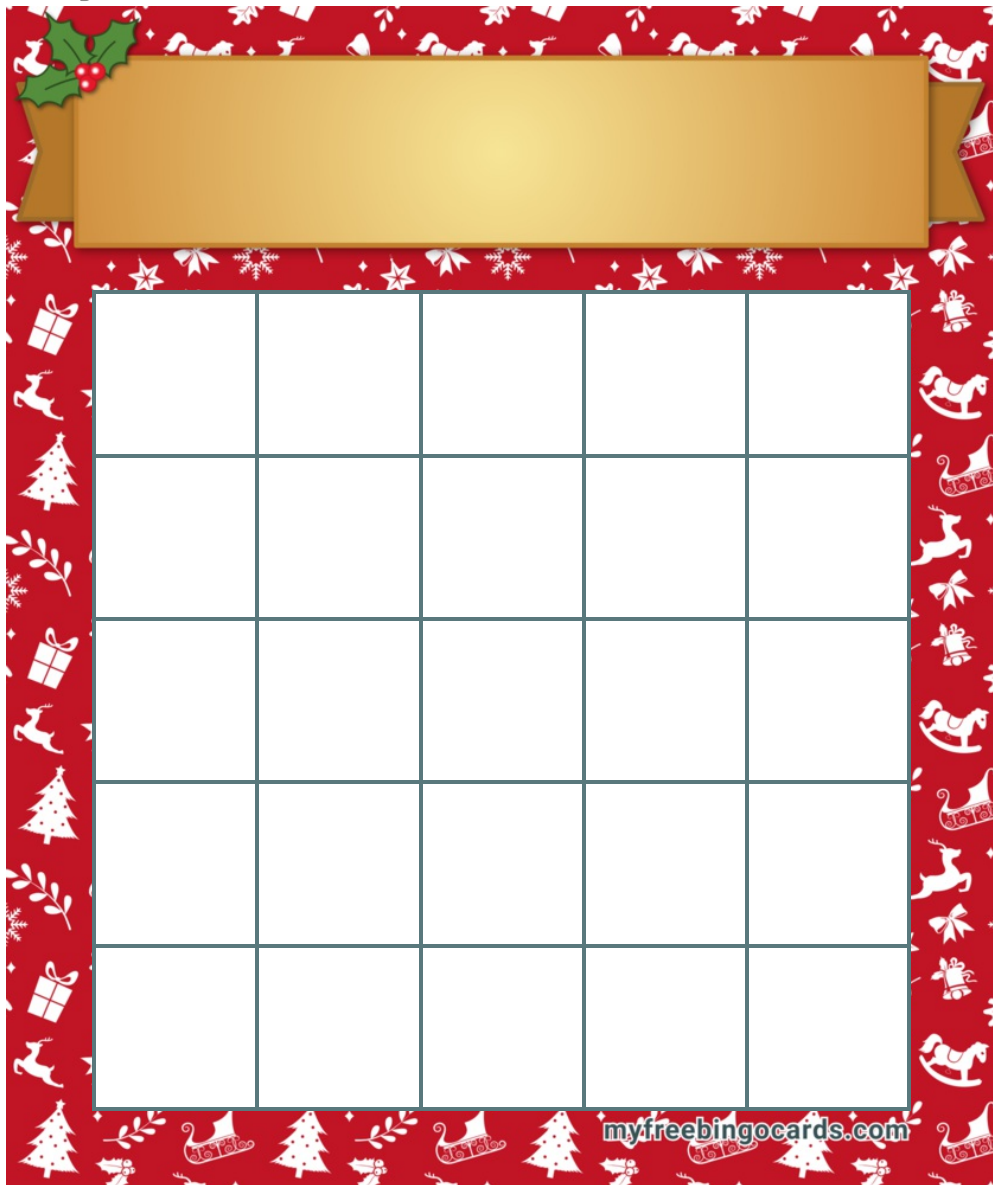
Bingo Card ID 019