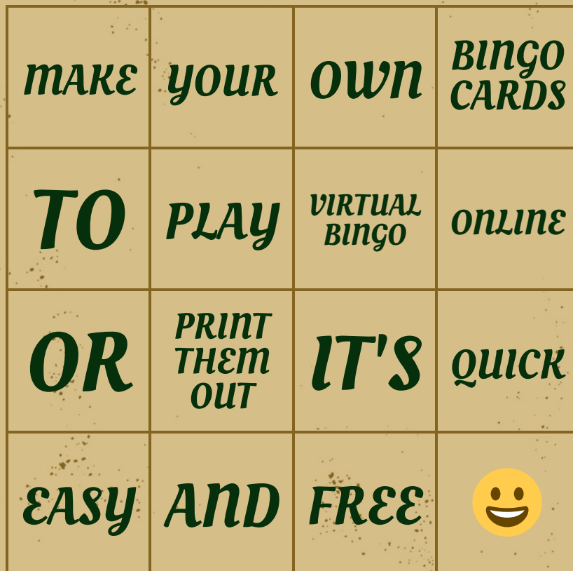
Bingo Card ID 022