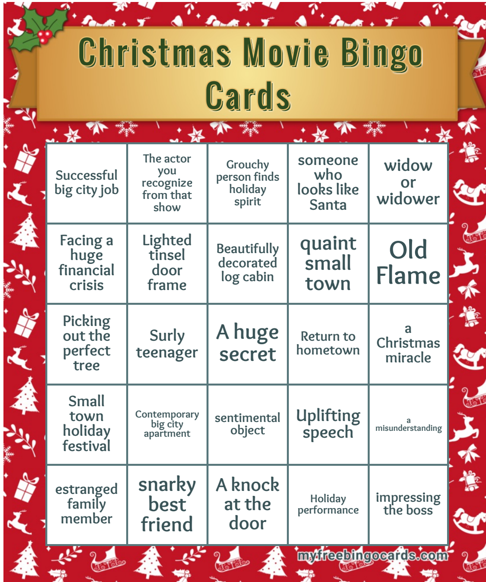
Bingo Card ID 017