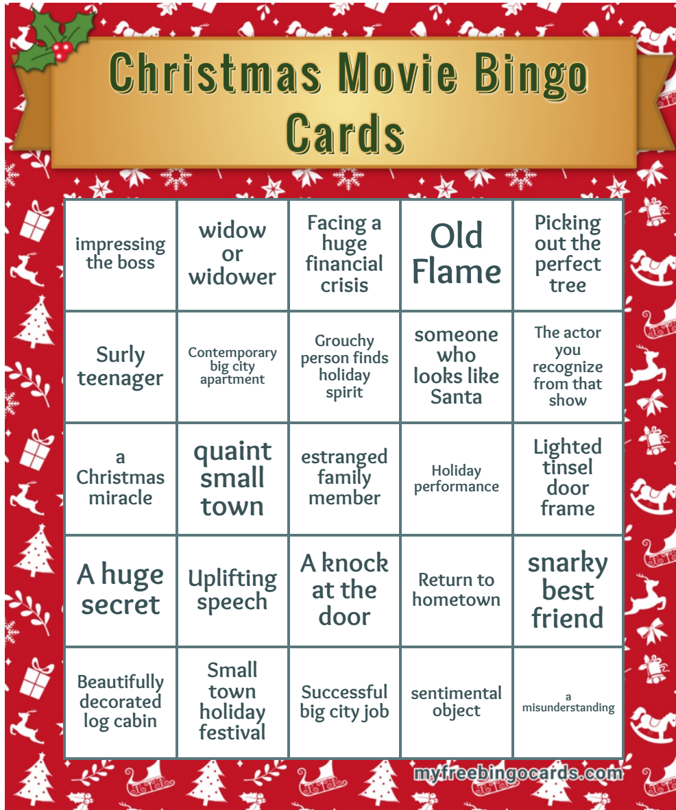
Bingo Card ID 013