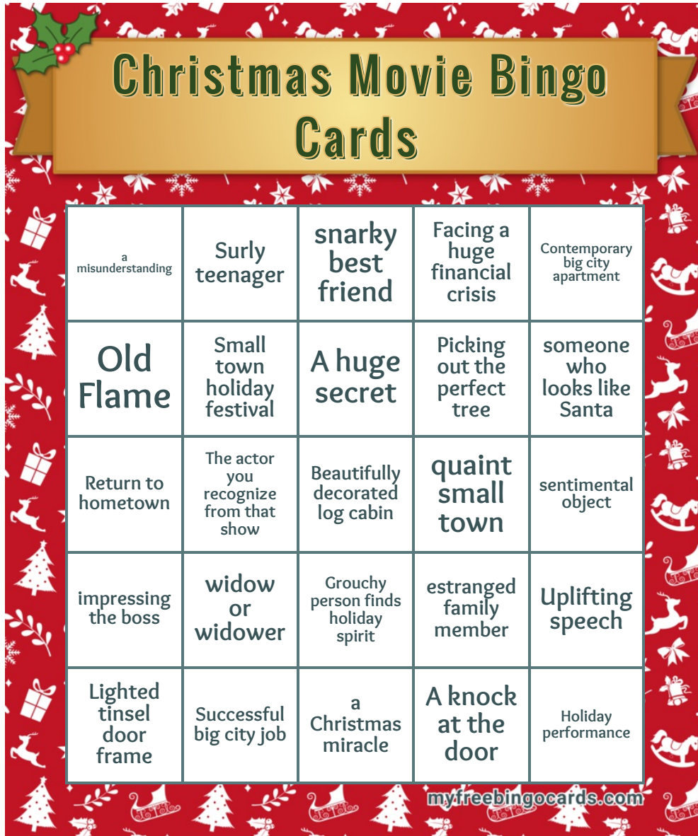
Bingo Card ID 025