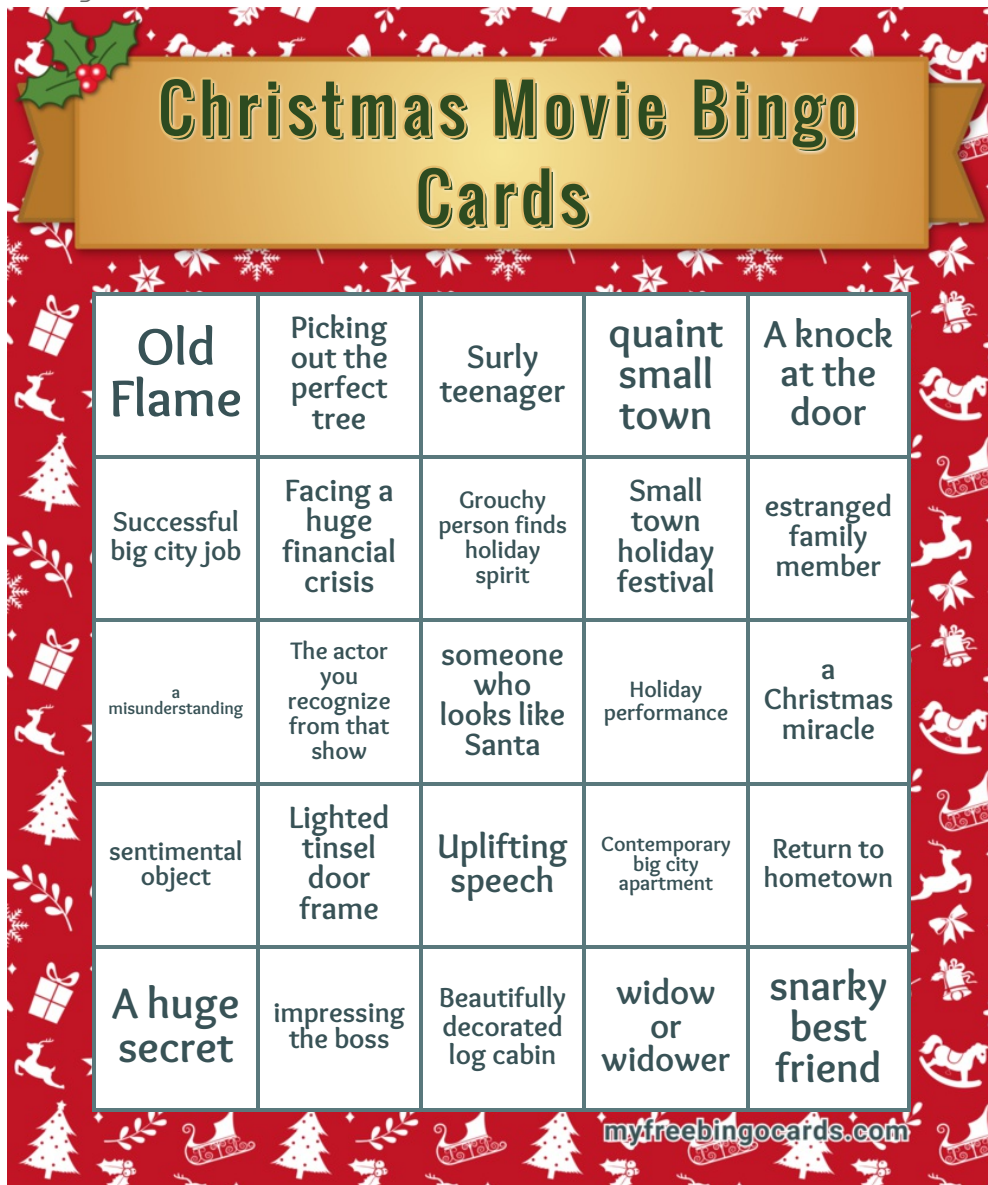
Bingo Card ID 009