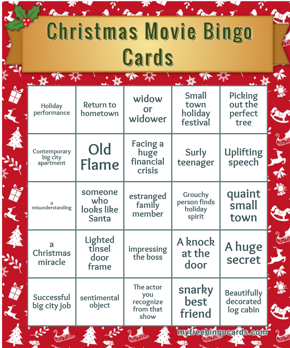
Bingo Card ID 019