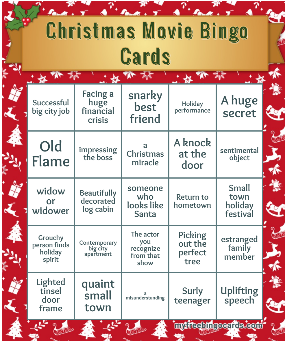
Bingo Card ID 005